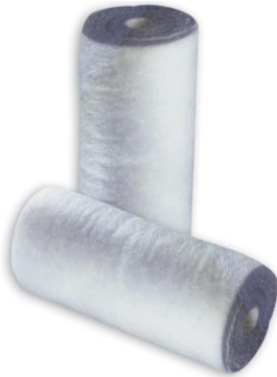
figure 1: Aquatrex filters